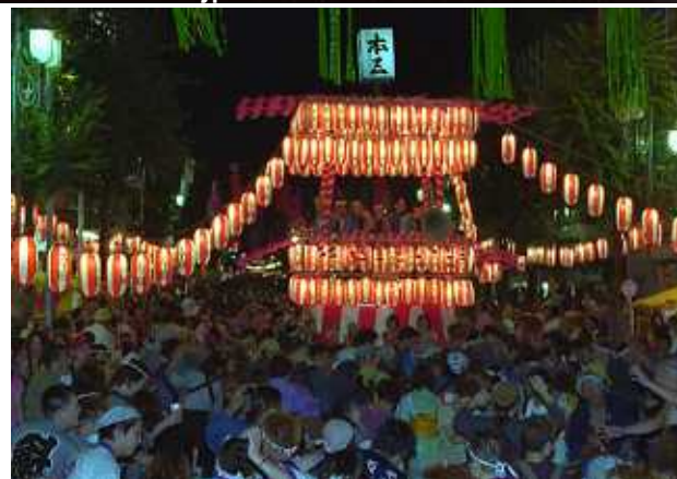
A festival in the city of Kiryu

http://www.el.gunma-u.ac.jp/ITMPM/CPIM2010/